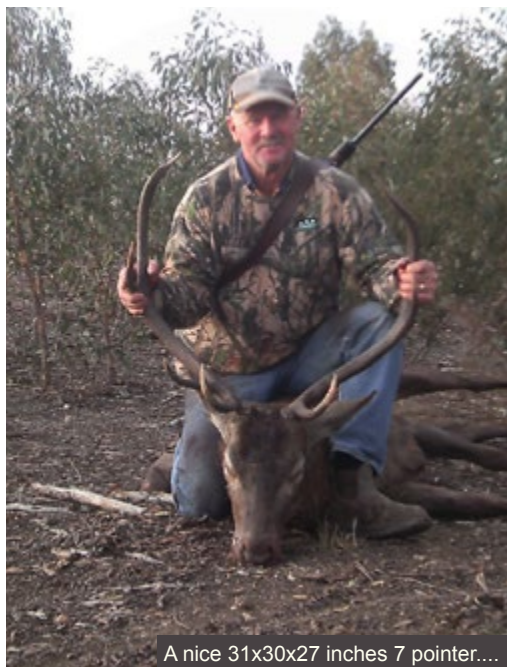
A nice 31x30x27 inches 7 pointer....

Up this morning nice and early, made a coffee and such a nice morning decided to take it out on the deck and enjoy the morning.....no sooner sat the arse down and roooooooooaaaaarrrrrrr.....shit that was close, sat and listened for a while and another half hearted roar.